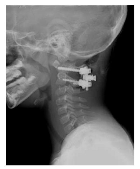
Fig. 3A: Postoperative lateral cervical spine film showing technique of C1 lateral mass screws and C2 pedicle screws in a 6-year-old child with an os odontoideum.

In addition to the functional limitations imposed by this disorder, children with hyperhidrosis feel stigmatized, becoming socially withdrawn. The first-line treatment for this disorder uses topical agents, such as Drysol, in an attempt to control the sweating. Quite often, topical agents and other medical treatments fail to control sweating. In which case, a permanent surgical treatment can be used. Thoracoscopic sympathectomy, a minimally invasive procedure in which the sympathetic nerves to the extremities are severed, typically provides immediate, permanent cessation of excessive sweating.