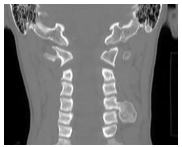
Fig. 5: Coronal CT reformat of a C4 osteochondroma in a 5-year-old boy with a mass growing in his neck.

To provide care for children requiring a multidisciplinary approach to their spinal disorder, a team member is available 24 hours a day to answer questions or facilitate a formal evaluation. For children living outside of metro Atlanta, the Children's Neuro Spine Care for Kids program will help families with travel arrangements and local housing for the length of their stay in Atlanta. Emergency referrals can be made 24 hours a day by speaking directly with one of our neurosurgeons who can rapidly arrange either ground or air transportation.