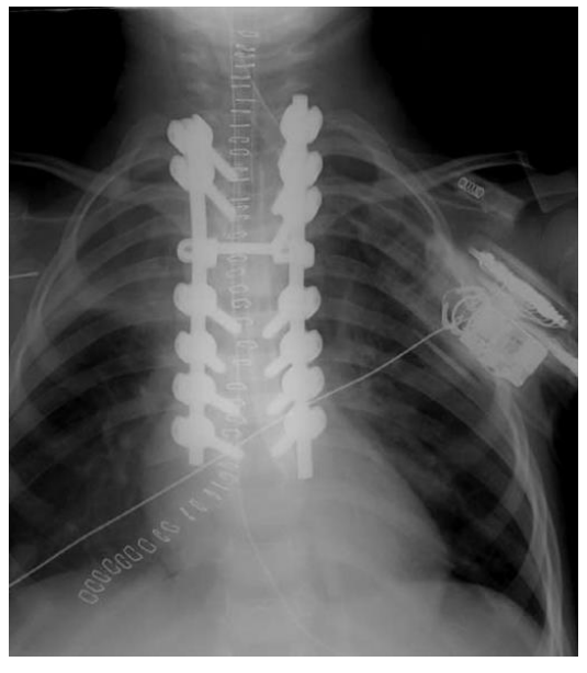
Fig. 4B: Postoperative film showing anteroposterior view of multiple pedicle screw and rod fixation of fracture.