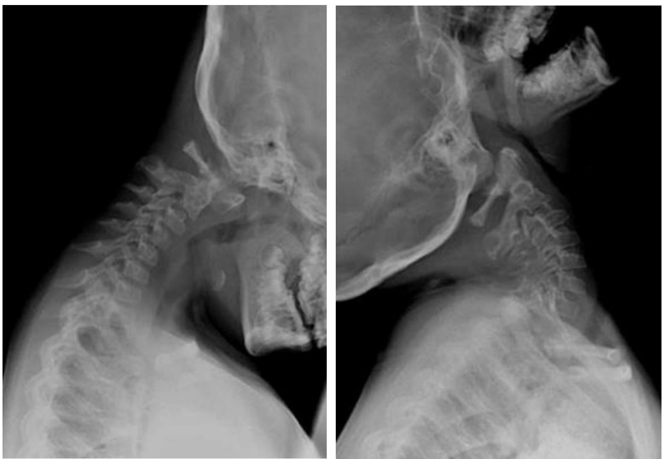
Figures 2A and 2B: Flexion/extension cervical spine series in a 6-year-old girl with Down syndrome and atlantoaxial instability.