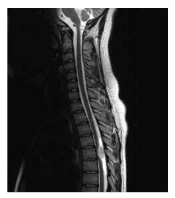
Fig. 6 T5 metastasis from a parietal lobe pleomorphic xanthoastrocytoma in a 16-year-old girl. The patient only presented with back pain and underwent complete resection of the tumor.