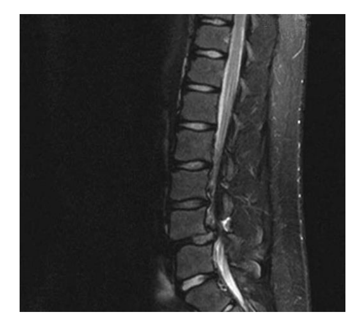
Fig. 7: Magentic resonance imaging (MRI) showing traumatic L4 to L5 spondylolysis with disruption of the intervertebral disc at L4 to L5.