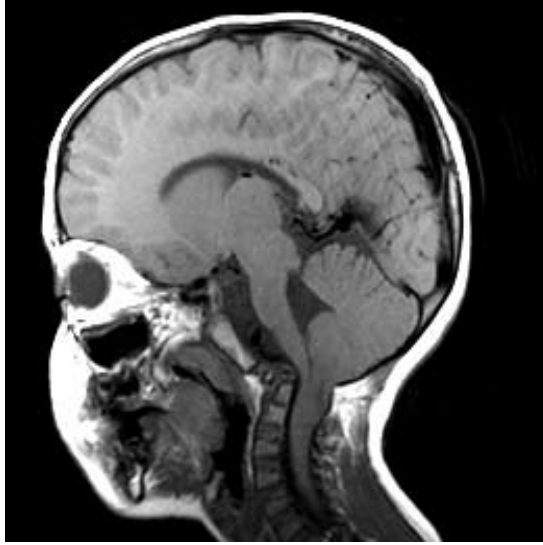
Figure 1: 5-year-old child with basilar impression. Note the compression of the brainstem from the dens.

In children with these rare craniocervical junction disorders, the skull progressively settles down on the upper cervical spine to the point that the spine is pushing up into the brainstem. Basilar invagination (primary invagination of the spine through the foramen magnum) and basilar impression (invagination of the spine through the foramen magnum) and basilar impression (invagination of the spine through the foramen magnum) are spine to a separate primary disease process, such as Hajdu-Cheney syndrome) are slow, progressive processes and lead to a change in voice, dysphagia,