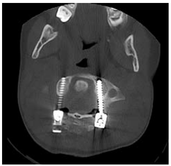
Fig. 3B: Postoperative axial CT test showing C1 lateral mass screws.