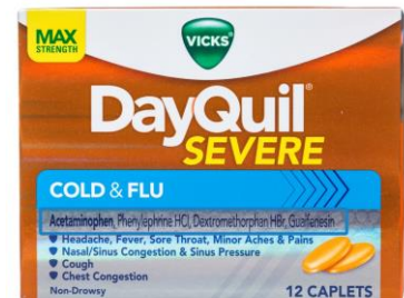
This product contains acetaminophen, phenylephrine and dextromethorphan