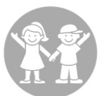
Photo ID #46