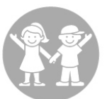
Photo ID #20