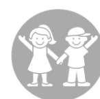
Photo ID #31